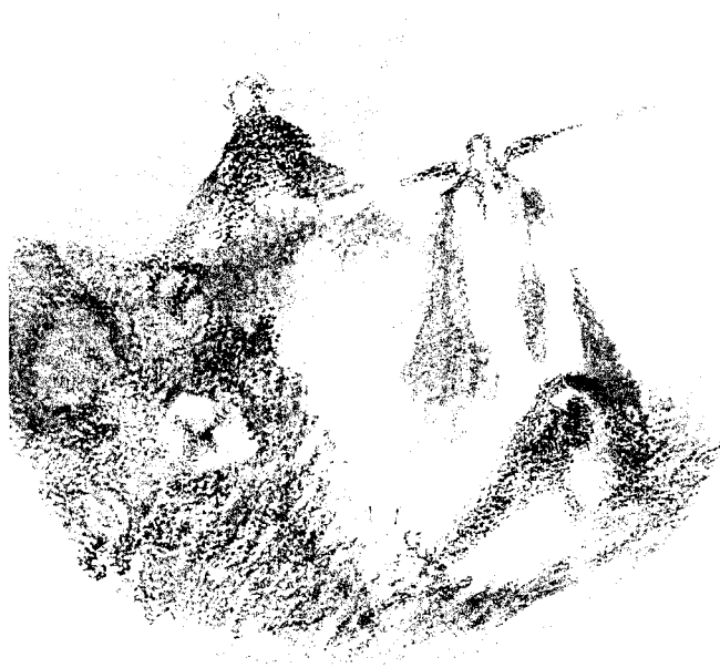
In this pastel sketch by Rudolf Steiner, the working of cosmic forces into the still heavy and mist-laden atmosphere of Atlantis is shown as guided by god-like angelic beings. Out of the downward streaming colours are born the types of the lion, cow, and bird (left), while to the right a kind of cave unfolds inner life and form. (Preliminary sketch for the large cupola of the Goetheanum ceiling, Dornach, Switzerland).

matured in order to develop an inner consciousness of self. At length, the fourth age arrived. At this stage something of tremendous importance took place, which had been prepared by all that had previously happened.